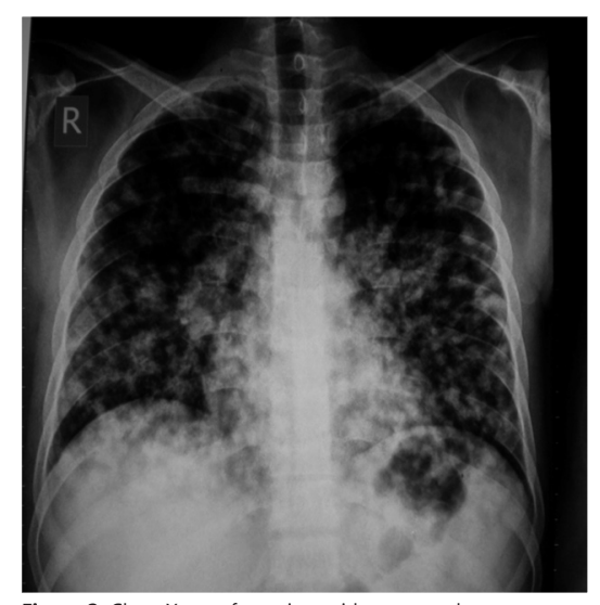
Figure 2. Chest X-ray of a patient with severe pulmonary histoplasmosis, showing diffuse nodular infiltration.